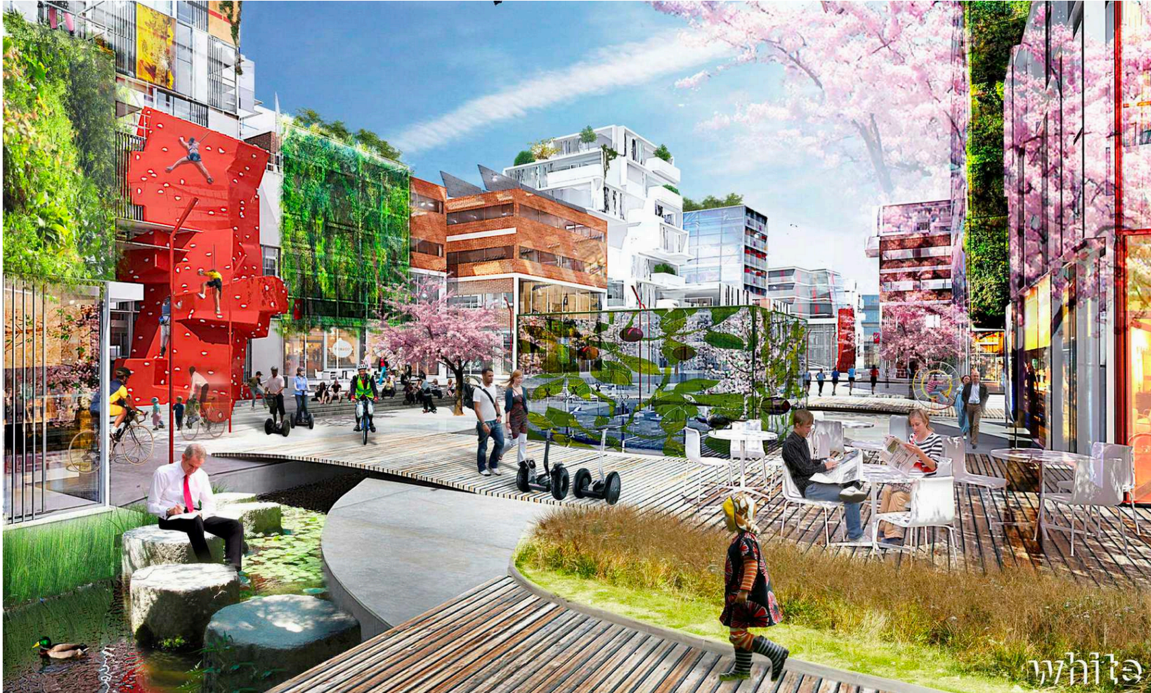
Visionsbild Science Village. Illustration: White.